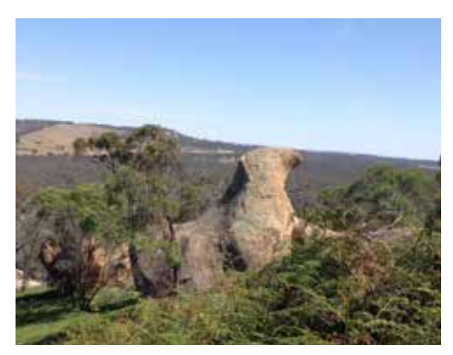
Seal Rock, Kooyoora State Park

In May a group of Participants enjoyed a day trip to the Eucalyptus Distillery in Inglewood and the Melville Caves. They were lucky enough to have a tour of the Eucalyptus Factory to see how the Eucalyptus Oil was produced.